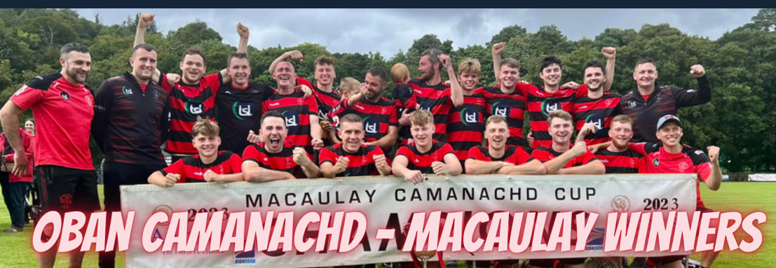
OBAN CAMANACHD - MACAULAY WINNERS