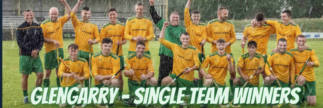
GLENGARRY - SINGLE TEAM WINNERS