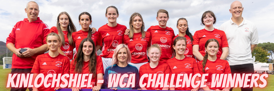
KINLOCHSHIEL - WCA CHALLENGE WINNERS