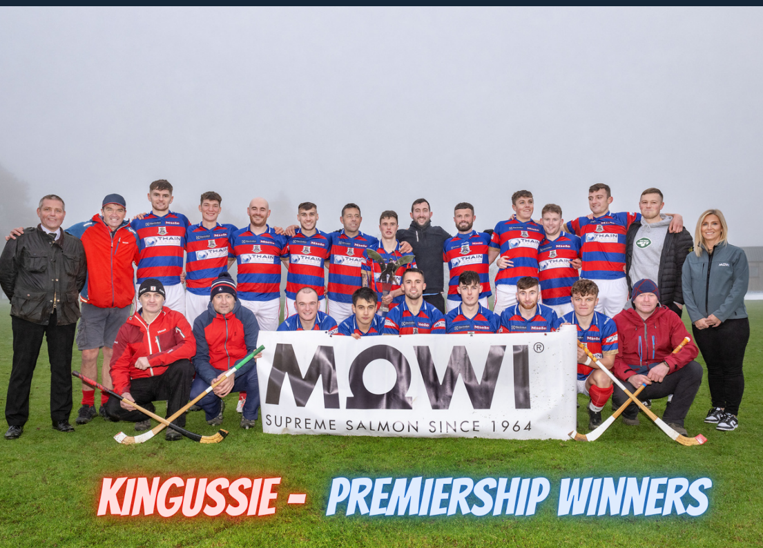
KINGUSSIE - PREMIERSHIP WINNERS