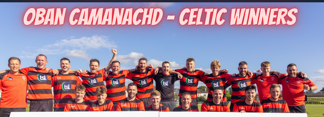
OBAN CAMANACHD - CELTIC WINNERS