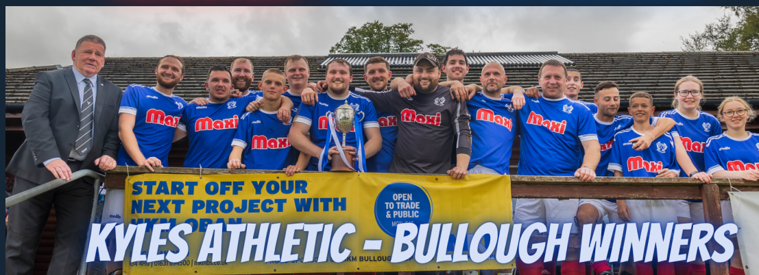
KYLES ATHLETIC - BULLOUGH WINNERS