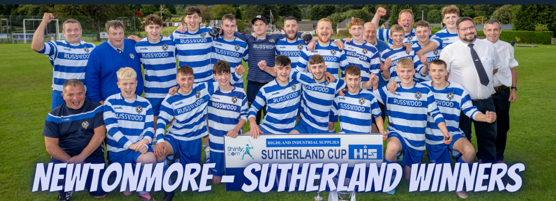
NEWTONMORE - SUTHERLAND WINNERS