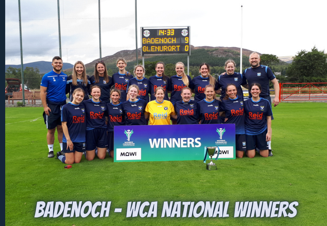
BADENOCH - WCA NATIONAL WINNERS