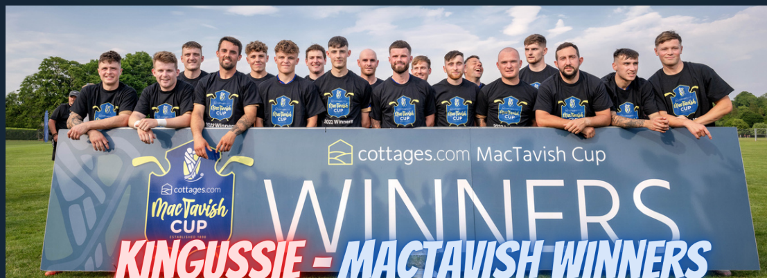
WINNERS KINGUSSIE - MACTAVISH WINNERS