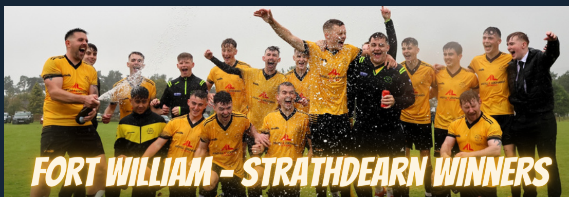
FORT WILLIAM - STRATHDEARN WINNERS