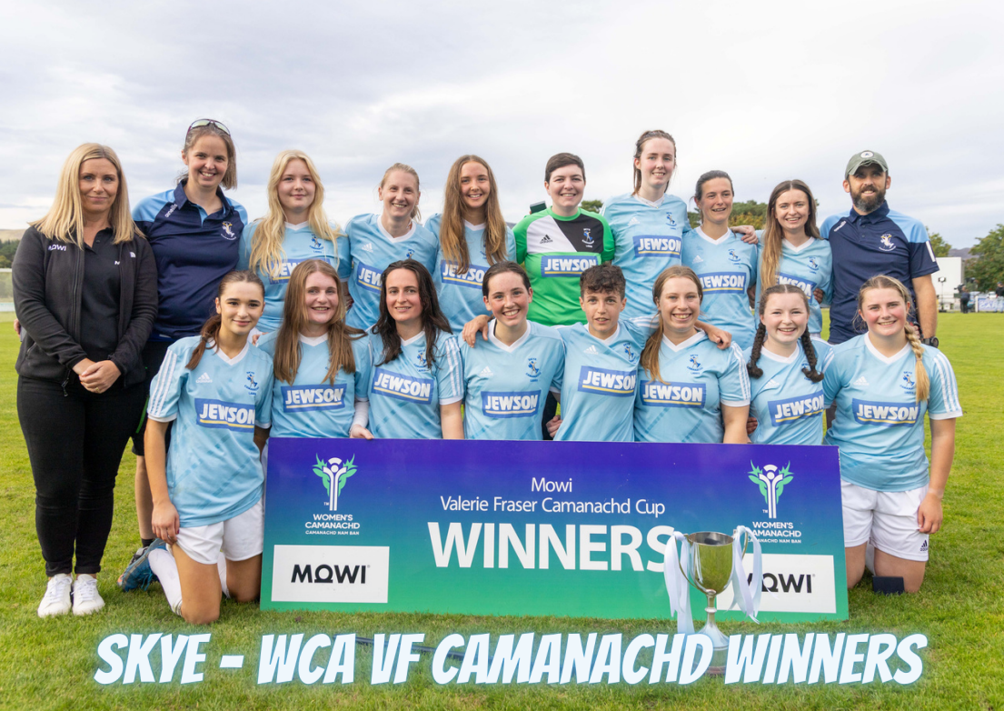
SKYE - WCA VF CAMANACHD WINNERS