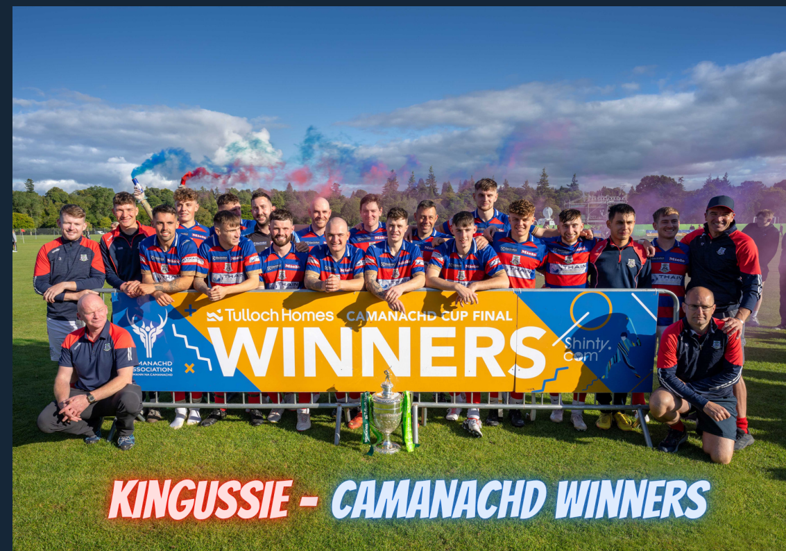
KINGUSSIE - CAMANACHD WINNERS